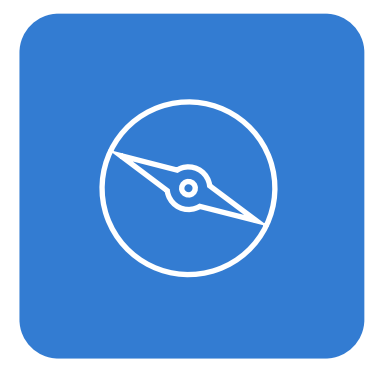
Development and Enrichment Activities